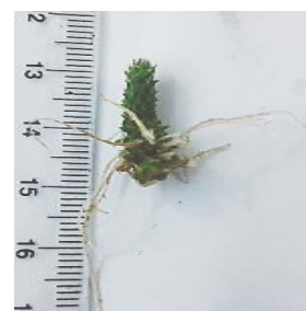
Figure 5. Rooting of micropropagated shoots of Opuntia ficus indica Al-Hoceima variety.

Statistical analysis of the proliferation stage showed that BAP concentration differentially influences the shoot growth of the two varieties. Shoot growth environmental responses are dependent on genotype due to distinct nutritional requirements for optimal growth (Calderón-Paniagua et al. , 2001). In this study, supplementation with 0.5 mg/L BAP proved to be the most effective culture medium for optimal growth, similar to previous work (García-Saucedo et al. , 2005). Supplementation with 5.0 mg/L BAP has been reported to regenerate a large number of shoots by explant (Khalafalla et al. , 2007). However, we found that a high concentration of exogenous BAP decreased the number of buds produced by both O. ficus-indica varieties, in agreement with previous findings (Escobar A et al. , 1986).