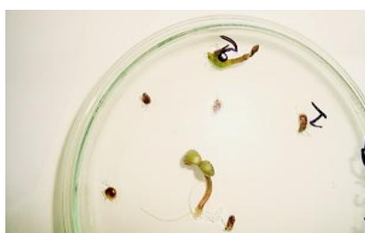
Figure 2. Opuntia ficus-indica plants germinated in MS (Murashige and Skoog, 1962), Al-Hoceima variety.