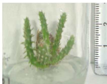
Figure 4. Multiple shoot proliferation on MS medium supplemented with benzyladenine (2 mg/L), Tétouan variety after 4 weeks.