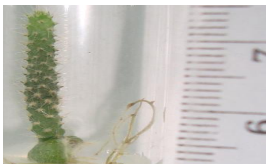
Figure 3. Seedlings of Opuntia ficus-indica in MS medium (Murashige and Skoog, 1962), Al-Hoceima variety which were cut into segments and used as a source of explants for multiplication.

Elongated shoots were transferred to different rooting supports to allow root formation. The effect of auxin supplementation on the number of roots was then investigated (Figure 5, Table 4). The Tétouan variety had significantly more roots in MS 1/2 30S+0.2 IBA medium ( p=0.018 ) than the Al-Hoceima variety. When initially treated in the dark (first 4 d of cultivation), both varieties had a greater number of roots (Table 5). Interestingly,